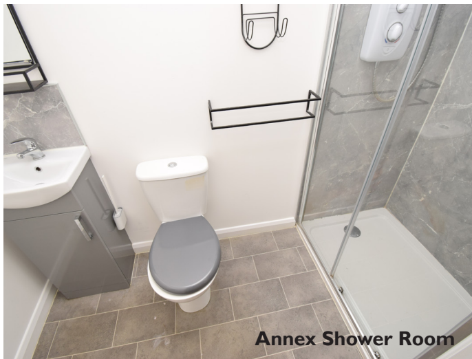
Annex Shower Room