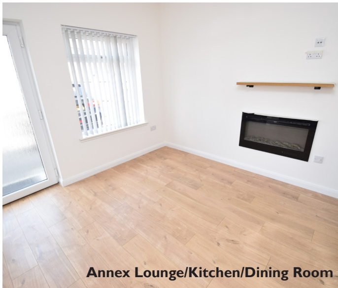
Annex Lounge/Kitchen/Dining Room