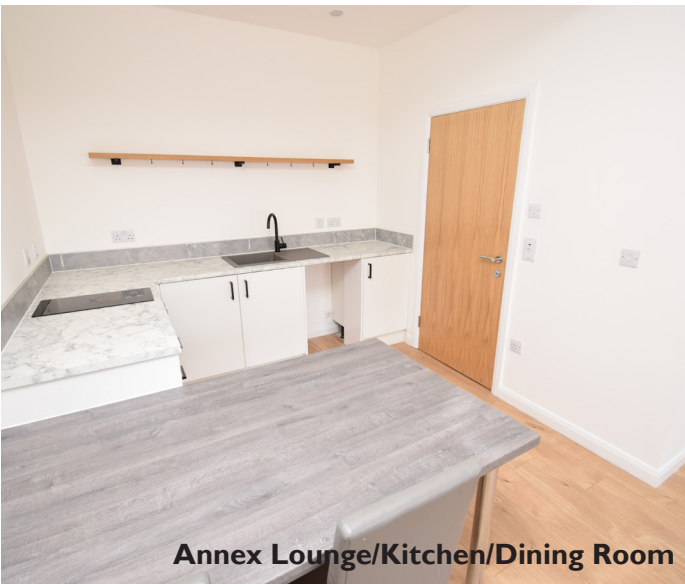
Annex Lounge/Kitchen/Dining Room