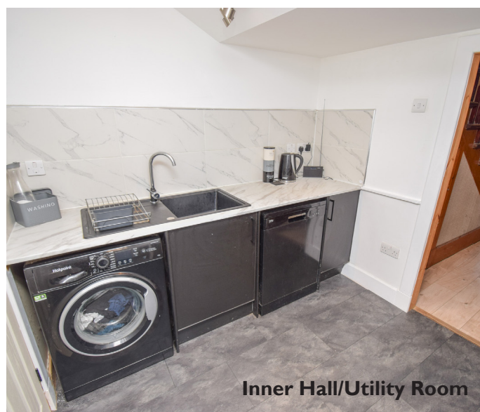
Inner Hall/Utility Room